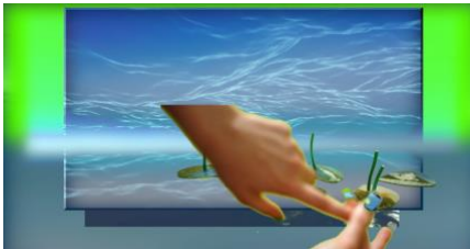
32.MIN.RELAX (HOW TO BUILD AN ARCHIPELAGO).2 DIGITAL VIDEO, HD, COLOR, SOUND, 32', 2015