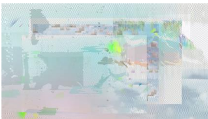
ZABRISKIE POV (ANIM.) DIGITAL VIDEO, FULL HD, COLOR, SOUND, 3'35", 2015

Among the various video genres born directly on YouTube, some have the sole purpose of relaxing their viewers. They are long videos, often making use of tropical imagery, which serves as an emblem of this audio-visual escape from the western world. The video 32.min.RELAX (How to Build an Archipelago).2 takes its cue from what it represents, probably the most influential aspects on an economic and environmental level, namely the creation of artificial archipelagos in palm-tree form off the coast of Dubai.