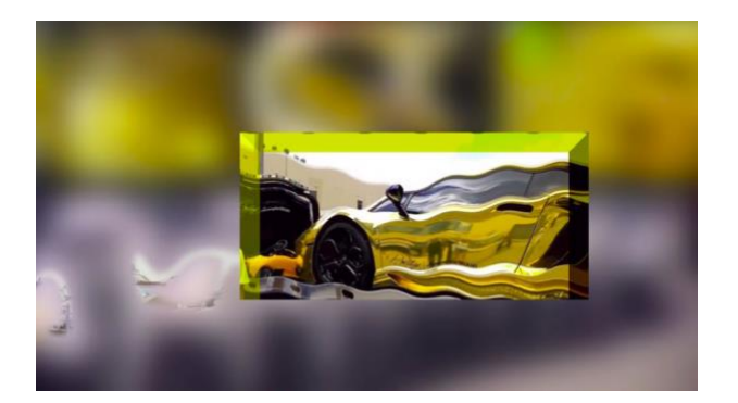
IN DA KAR FINALE DIGITAL VIDEO, FULL HD, COLOR, SOUND, 2'52", 2015