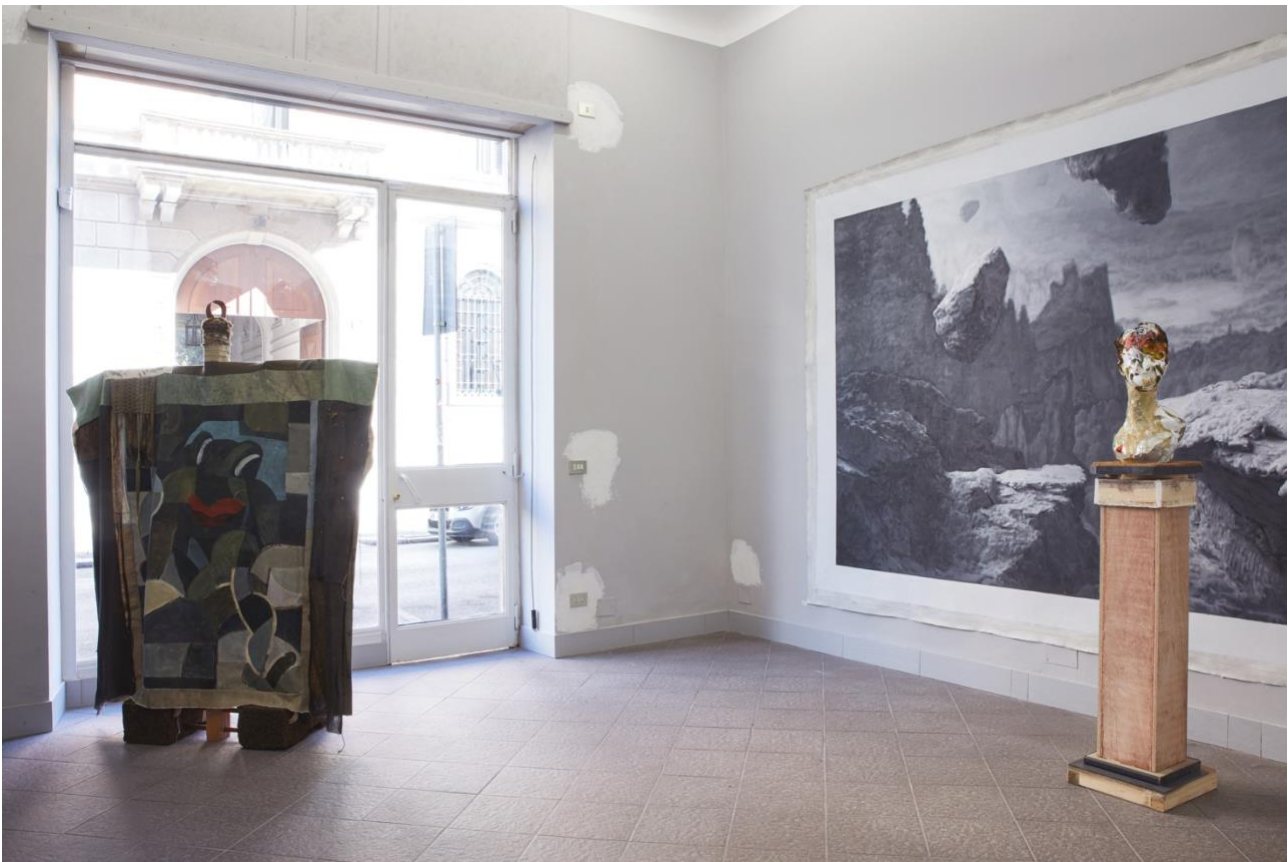
Installation view: Case Chiuse #07, Bosco Verticale / Top Floor, Milano (2019)