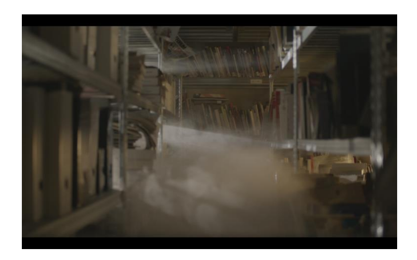
Milano Anno Zero (Teaser), 2017 - digital video, HD, color, sound, 26"

In the past the archive was simply separate from the outside. Today air and water come into the archives' cooling systems to preserve papers, documents or servers. In this video the archive has developed a real atmospheric system. A cloud passes through the files, something in between fog and smoke, maybe fire.